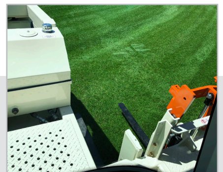
Easy view of pallet forks out all sides

TREBRO TURF EQUIPMENT Trebros The Future of Turf Harvesting